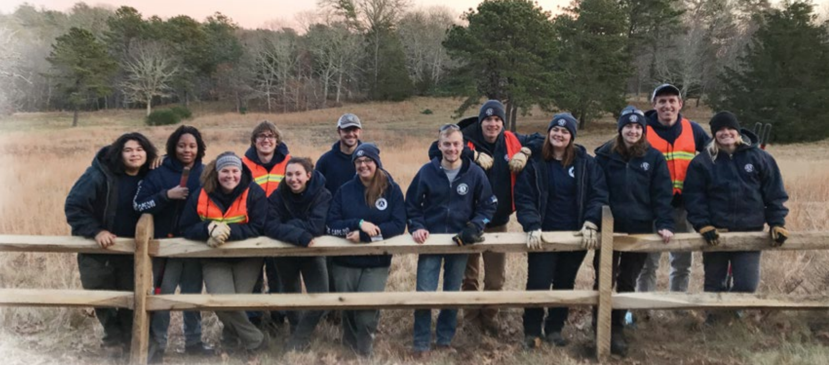
The AmeriCorps team at Bell Farm