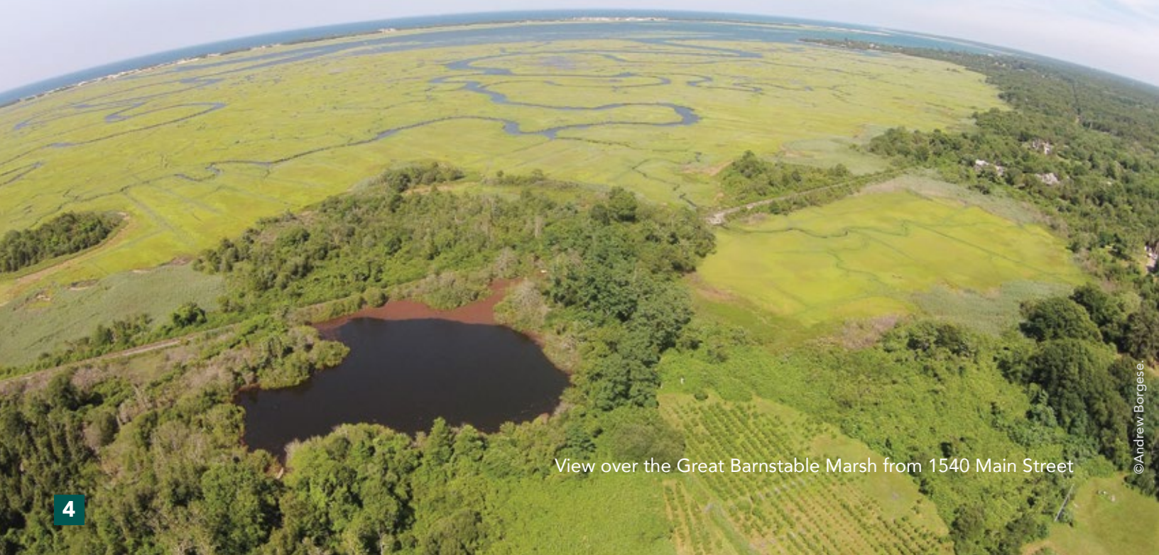
View over the Great Barnstable Marsh from 1540 Main Street