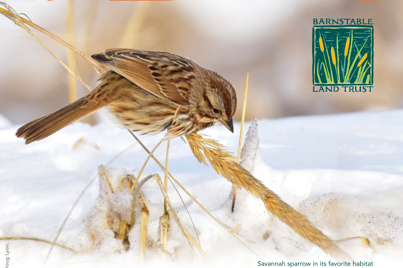
Savannah sparrow in its favorite habitat